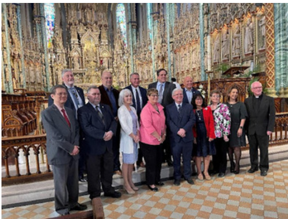
Members of the OCSTA Board of Directors at Notre-Dame Cathedral, Ottawa