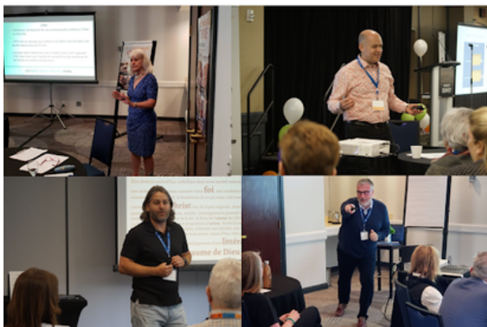
Our four speakers in action.

The student trustees were also treated to their own workshop and to end this exceptional day in style, a new surprise awaited our participants at the premises of Groupe Media TFO, where we were received for a happy hour, during which we had the pleasure of visiting the channel’s interactive production studios.